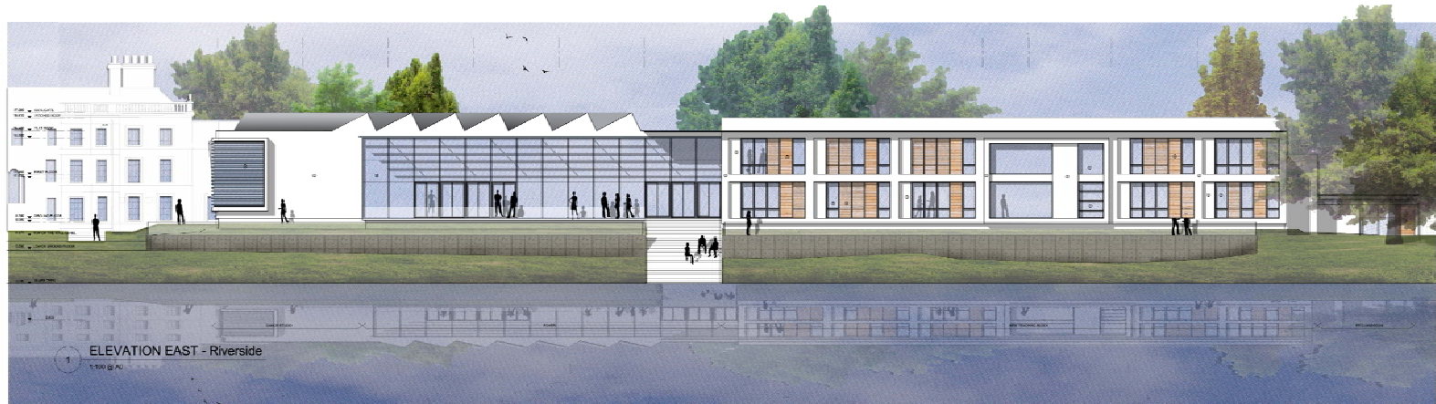
1 ELEVATION EAST - Riverside 1:100 @ A0