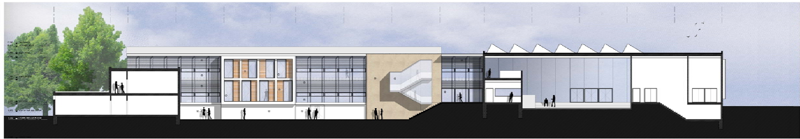
2 ELEVATION WEST - Courtyard 1:100 @ A0